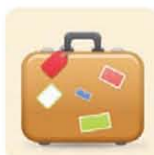
Retiring in style