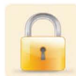
Protecting what matters most