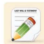
Leaving a lasting legacy

Always listening, your Investment Advisor will work with you in an honest and straightforward manner – offering advice that's easy to understand and the help you need to develop a financial plan specifically for you and your family's future.