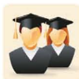
Sending your children to college