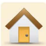
Your first home

No matter what your goals are, or stage of life you're in, our Investment Advisors are uniquely qualified to design a financial plan based on your current situation with the flexibility to adjust for future needs and wants.